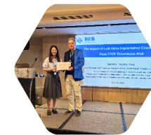
Best Oral Awarding